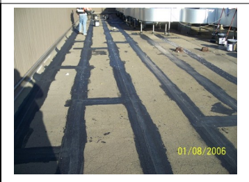
Stripping of seams with Emulsion.